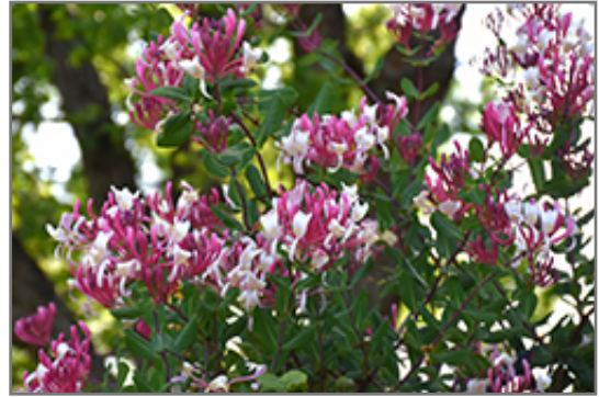
Peaches And Cream Honeysuckle flowers Photo courtesy of NetPS Plant Finder

This woody vine does best in full sun to partial shade. It does best in average to evenly moist conditions, but will not tolerate standing water. It is not particular as to soil type or pH. It is somewhat tolerant of urban pollution. Consider applying a thick mulch around the root zone in winter to protect it in exposed locations or colder microclimates. This is a selection of a native North American species.