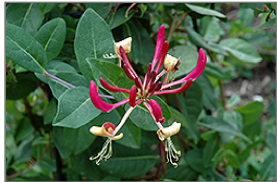
Peaches And Cream Honeysuckle flowers

Peaches And Cream Honeysuckle is recommended for the following landscape applications;