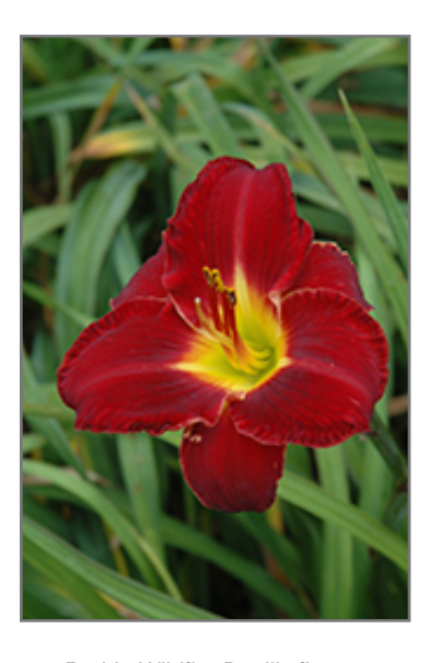
Prairie Wildfire Daylily flowers

Prairie Wildfire Daylily will grow to be about 18 inches tall at maturity, with a spread of 24 inches. When grown in masses or used as a bedding plant, individual plants should be spaced approximately 18 inches apart. It grows at a medium rate, and under ideal conditions can be expected to live for approximately 10 years. As an herbaceous perennial, this plant will usually die back to the crown each winter, and will regrow from the base each spring. Be careful not to disturb the crown in late winter when it may not be readily seen!