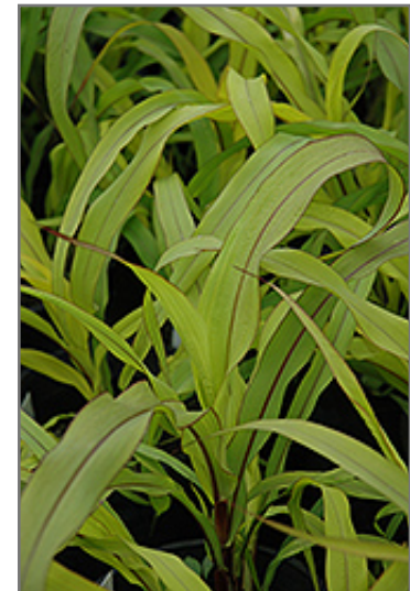
Jester Millet foliage