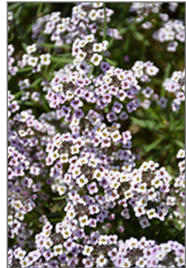
Blushing Princess Sweet Alyssum flowers

Blushing Princess Sweet Alyssum is recommended for the following landscape applications;