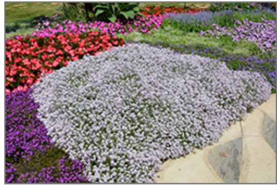
Blushing Princess Sweet Alyssum in bloom

Blushing Princess Sweet Alyssum is a fine choice for the garden, but it is also a good selection for planting in hanging baskets. Because of its trailing habit of growth, it is ideally suited for use as a 'spiller' in the 'spiller-thriller-filler' container combination; plant it near the edges where it can spill gracefully over the pot. Note that when growing plants in outdoor containers and baskets, they may require more frequent waterings than they would in the yard or garden.