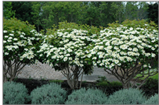
Compact European Cranberry in bloom

Compact European Cranberry is a dense multi-stemmed deciduous shrub with a more or less rounded form. Its average texture blends into the landscape, but can be balanced by one or two finer or coarser trees or shrubs for an effective composition.