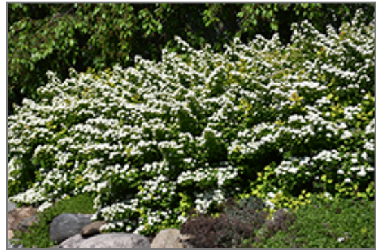
Glow Girl Birch Leaf Spirea in bloom

Glow Girl Birch Leaf Spirea is recommended for the following landscape applications;