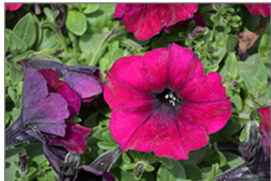
Easy Wave Burgundy Velour Petunia flowers