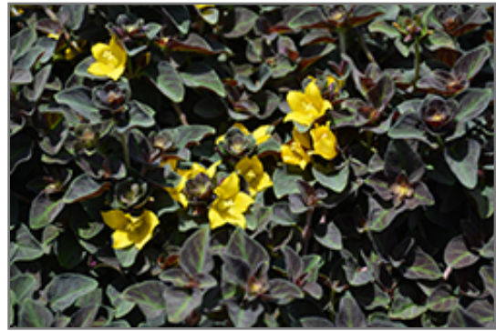
Midnight Sun Moneywort flowers

Midnight Sun Moneywort is recommended for the following landscape applications;