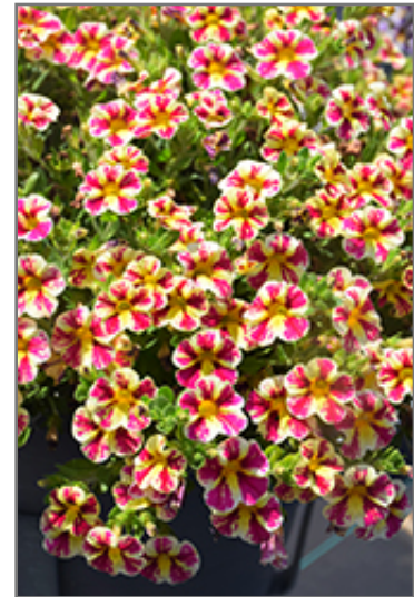
Superbells Holy Moly! Calibrachoa flowers

Superbells Holy Moly! Calibrachoa is recommended for the following landscape applications;