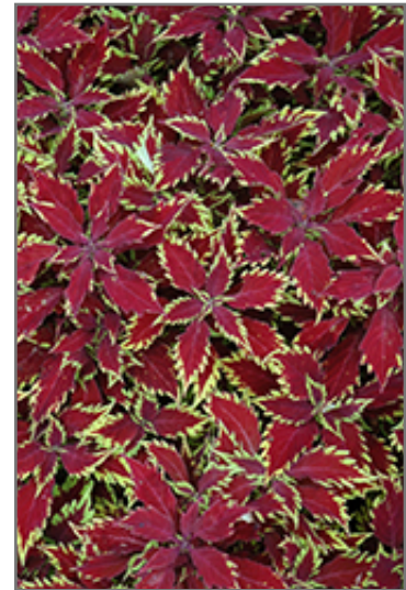
ColorBlaze Apple Brandy Coleus foliage