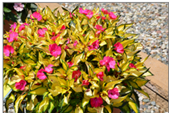
SunPatiens Compact Tropical Rose New Guinea Impatiens in bloom