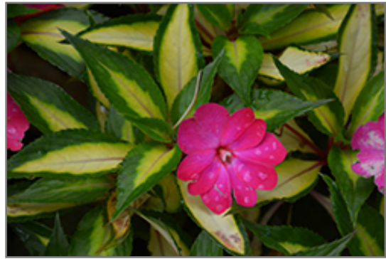
SunPatiens Compact Tropical Rose New Guinea Impatiens flowers

SunPatiens Compact Tropical Rose New Guinea Impatiens will grow to be about 24 inches tall at maturity, with a spread of 24 inches. When grown in masses or used as a bedding plant, individual plants should be spaced approximately 20 inches apart. Its foliage tends to remain dense right to the ground, not requiring facer plants in front. This fast-growing annual will normally live for one full growing season, needing replacement the following year.