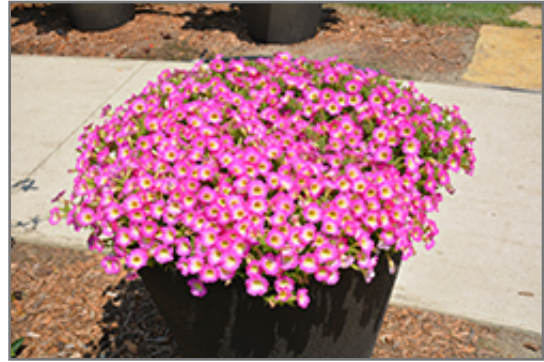
Supertunia Daybreak Charm Petunia in bloom