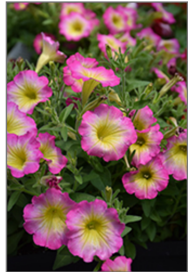
Supertunia Daybreak Charm Petunia flowers

Supertunia Daybreak Charm Petunia is a dense herbaceous annual with a trailing habit of growth, eventually spilling over the edges of hanging baskets and containers. Its medium texture blends into the garden, but can always be balanced by a couple of finer or coarser plants for an effective composition.