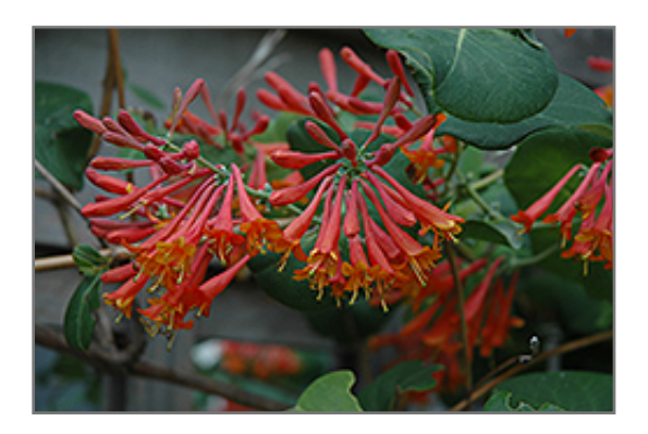
Dropmore Scarlet Trumpet Honeysuckle flowers