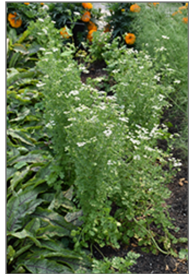
Santo Cilantro in bloom

Santo Cilantro is a good choice for the edible garden, but it is also well-suited for use in outdoor pots and containers. It can be used either as 'filler' or as a 'thriller' in the 'spiller-thriller-filler' container combination, depending on the height and form of the other plants used in the container planting. Note that when growing plants in outdoor containers and baskets, they may require more frequent waterings than they would in the yard or garden.