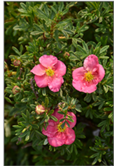
Bella Bellissima Potentilla flowers