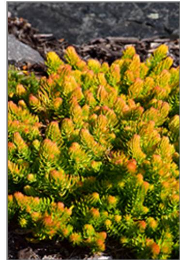
Angelina Stonecrop foliage