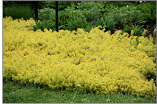
Angelina Stonecrop

This plant does best in full sun to partial shade. It prefers dry to average moisture levels with very well-drained soil, and will often die in standing water. It is considered to be drought-tolerant, and thus makes an ideal choice for a low-water garden or xeriscape application. It is not particular as to soil pH, but grows best in poor soils, and is able to handle environmental salt. It is highly tolerant of urban pollution and will even thrive in inner city environments. This is a selected variety of a species not originally from North America. It can be propagated by division; however, as a cultivated variety, be aware that it may be subject to certain restrictions or prohibitions on propagation.