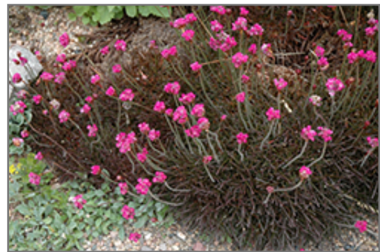
Red-leaved Sea Thrift in bloom