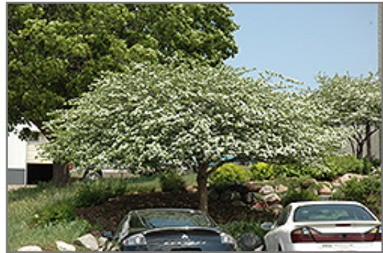
Thornless Cockspur Hawthorn in bloom