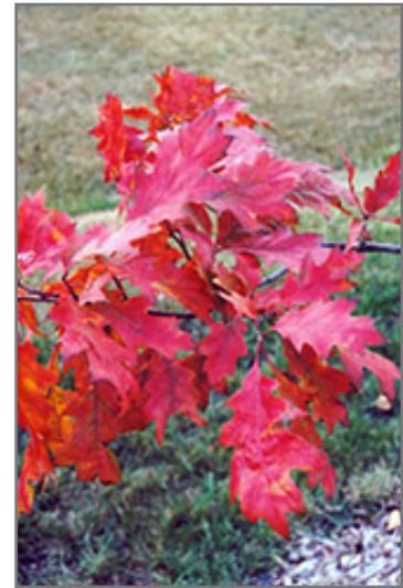
Red Oak in fall

This tree should only be grown in full sunlight. It prefers to grow in average to moist conditions, and shouldn't be allowed to dry out. It is not particular as to soil type, but has a definite preference for acidic soils, and is subject to chlorosis (yellowing) of the leaves in alkaline soils. It is highly tolerant of urban pollution and will even thrive in inner city environments. This species is native to parts of North America.