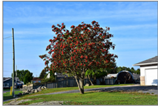
Showy Mountain Ash fruit