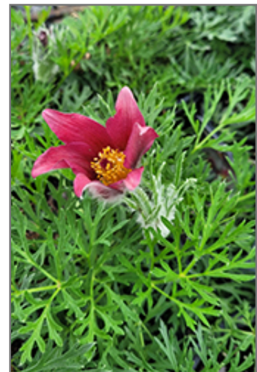
Red Pasqueflower flowers