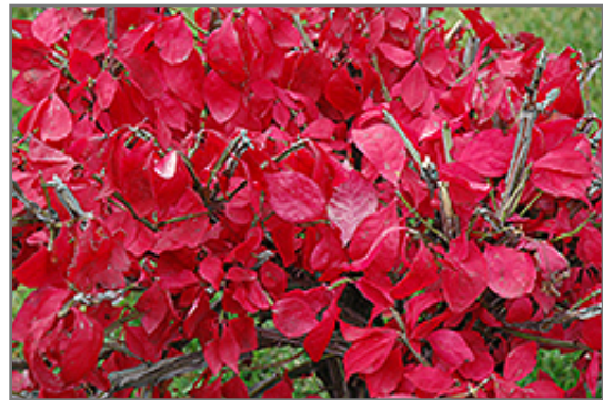
Compact Winged Burning Bush in fall