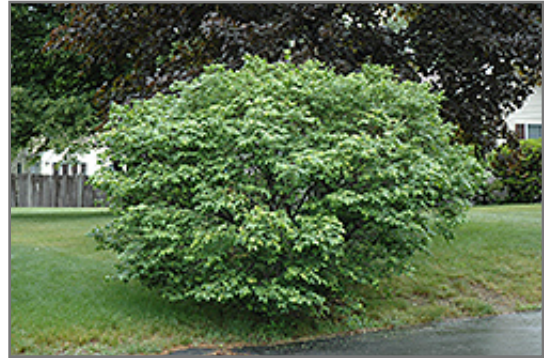
Compact Winged Burning Bush

This shrub performs well in both full sun and full shade. It is very adaptable to both dry and moist locations, and should do just fine under average home landscape conditions. It is not particular as to soil type or pH. It is highly tolerant of urban pollution and will even thrive in inner city environments. This is a selected variety of a species not originally from North America.