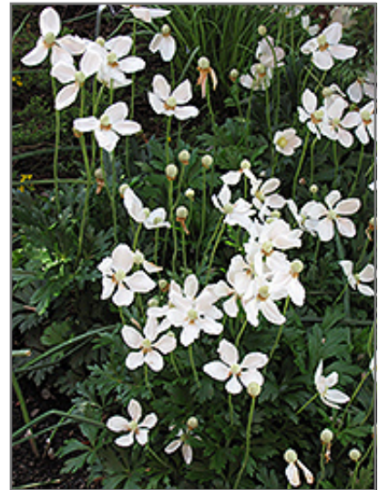
Snowdrop Windflower flowers