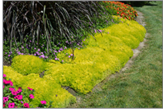
Lemon Coral Stonecrop

Lemon Coral Stonecrop will grow to be about 8 inches tall at maturity, with a spread of 12 inches. When grown in masses or used as a bedding plant, individual plants should be spaced approximately 10 inches apart. Its foliage tends to remain low and dense right to the ground. It grows at a fast rate, and under ideal conditions can be expected to live for approximately 10 years. As an herbaceous perennial, this plant will usually die back to the crown each winter, and will regrow from the base each spring. Be careful not to disturb the crown in late winter when it may not be readily seen!