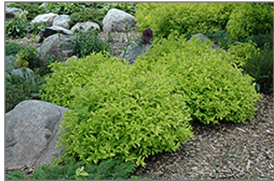
Goldmound Spirea