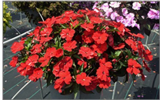
SunPatiens Compact Red New Guinea Impatiens in bloom

SunPatiens Compact Red New Guinea Impatiens is a fine choice for the garden, but it is also a good selection for planting in outdoor containers and hanging baskets. It can be used either as 'filler' or as a 'thriller' in the 'spiller-thriller-filler' container combination, depending on the height and form of the other plants used in the container planting. It is even sizeable enough that it can be grown alone in a suitable container. Note that when growing plants in outdoor containers and baskets, they may require more frequent waterings than they would in the yard or garden.