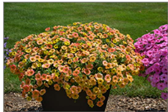
Supertunia Honey Petunia in bloom