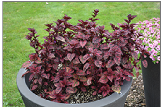
Hippo Red Polka Dot Plant