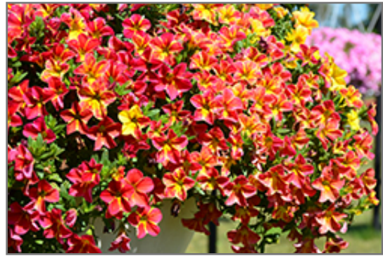
Aloha Nani Red Cartwheel Calibrachoa flowers

Aloha Nani Red Cartwheel Calibrachoa is recommended for the following landscape applications;