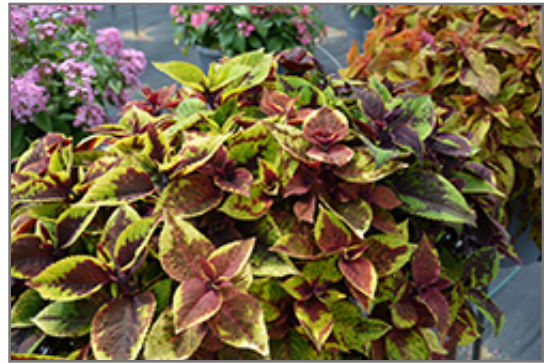
Premium Sun Pineapple Surprise Coleus

Premium Sun Pineapple Surprise Coleus is a fine choice for the garden, but it is also a good selection for planting in outdoor containers and hanging baskets. With its upright habit of growth, it is best suited for use as a 'thriller' in the 'spiller-thriller-filler' container combination; plant it near the center of the pot, surrounded by smaller plants and those that spill over the edges. It is even sizeable enough that it can be grown alone in a suitable container. Note that when growing plants in outdoor containers and baskets, they may require more frequent waterings than they would in the yard or garden.