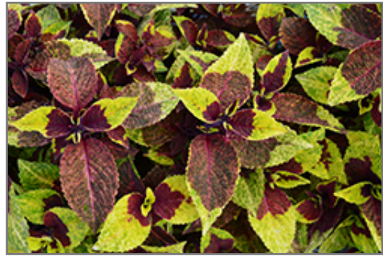
Premium Sun Pineapple Surprise Coleus foliage