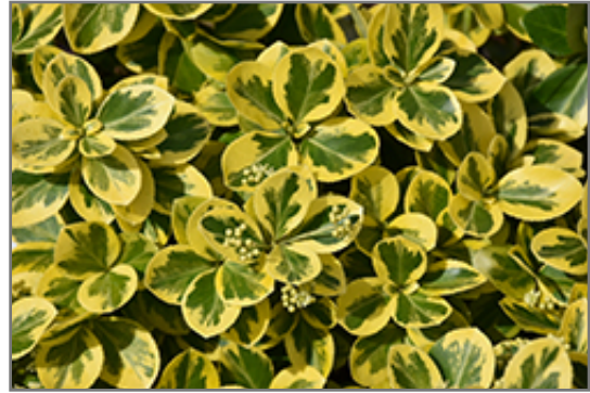
Gold Splash Wintercreeper flower buds

This shrub performs well in both full sun and full shade. It is very adaptable to both dry and moist locations, and should do just fine under typical garden conditions. It is not particular as to soil type or pH. It is highly tolerant of urban pollution and will even thrive in inner city environments, and will benefit from being planted in a relatively sheltered location. This is a selected variety of a species not originally from North America.