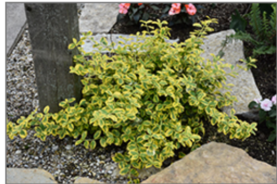
Gold Splash Wintercreeper