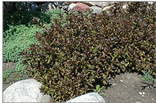
Dark Horse Weigela