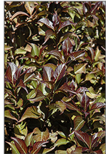
Dark Horse Weigela foliage

Dark Horse Weigela makes a fine choice for the outdoor landscape, but it is also well-suited for use in outdoor pots and containers. Because of its height, it is often used as a 'thriller' in the 'spiller-thriller-filler' container combination; plant it near the center of the pot, surrounded by smaller plants and those that spill over the edges. It is even sizeable enough that it can be grown alone in a suitable container. Note that when grown in a container, it may not perform exactly as indicated on the tag - this is to be expected. Also note that when growing plants in outdoor containers and baskets, they may require more frequent waterings than they would in the yard or garden. Be aware that in our climate, most plants cannot be expected to survive the winter if left in containers outdoors, and this plant is no exception. Contact our experts for more information on how to protect it over the winter months.