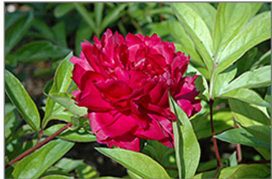
Philippe Rivoire Peony flowers

Philippe Rivoire Peony features bold fragrant double crimson flowers at the ends of the stems from late spring to early summer. The flowers are excellent for cutting. Its compound leaves emerge burgundy in spring, turning green in color throughout the season.