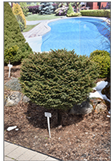
Little Gem Spruce (tree form)