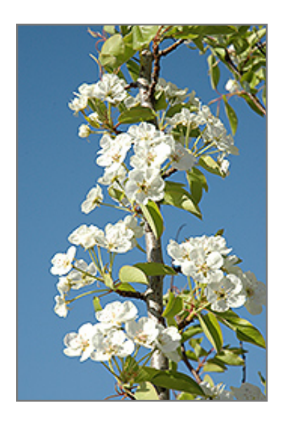
Summercrisp Pear flowers

Summercrisp Pear will grow to be about 25 feet tall at maturity, with a spread of 20 feet. It has a low canopy with a typical clearance of 4 feet from the ground, and is suitable for planting under power lines. It grows at a fast rate, and under ideal conditions can be expected to live for 70 years or more. This variety requires a different selection of the same species growing nearby in order to set fruit.