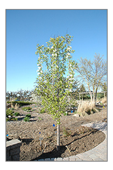
Summercrisp Pear in bloom