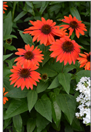
Sombrero Flamenco Orange Coneflower in bloom