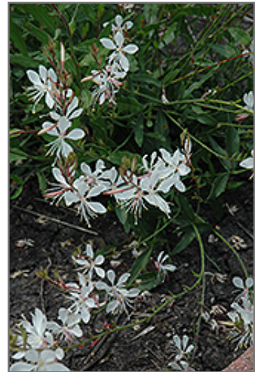
Sparkle White Gaura flowers