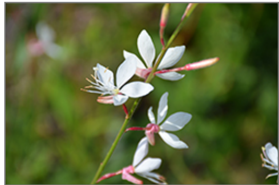
Sparkle White Gaura flowers