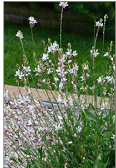
Sparkle White Gaura in bloom

Sparkle White Gaura is a fine choice for the garden, but it is also a good selection for planting in outdoor pots and containers. With its upright habit of growth, it is best suited for use as a 'thriller' in the 'spiller-thriller-filler' container combination; plant it near the center of the pot, surrounded by smaller plants and those that spill over the edges. It is even sizeable enough that it can be grown alone in a suitable container. Note that when growing plants in outdoor containers and baskets, they may require more frequent waterings than they would in the yard or garden. Be aware that in our climate, most plants cannot be expected to survive the winter if left in containers outdoors, and this plant is no exception. Contact our experts for more information on how to protect it over the winter months.