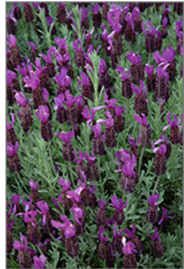
Anouk Supreme Spanish Lavender flowers

Anouk Supreme Spanish Lavender is recommended for the following landscape applications;