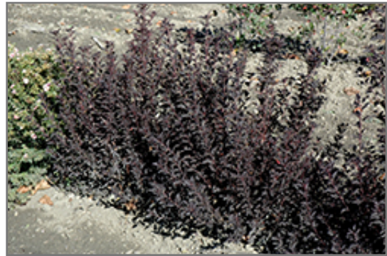
Tiny Wine Ninebark

This shrub does best in full sun to partial shade. It is very adaptable to both dry and moist locations, and should do just fine under average home landscape conditions. It is not particular as to soil type or pH. It is highly tolerant of urban pollution and will even thrive in inner city environments. This is a selection of a native North American species.