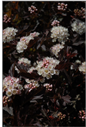
Tiny Wine Ninebark flowers

This shrub will require occasional maintenance and upkeep, and can be pruned at anytime. It has no significant negative characteristics.