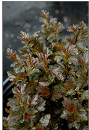
Tiny Wine Ninebark foliage