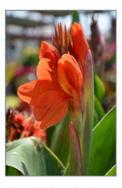
Toucan Dark Orange Canna flowers