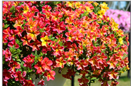
Aloha Nani Red Cartwheel Calibrachoa flowers

Aloha Nani Red Cartwheel Calibrachoa is recommended for the following landscape applications;