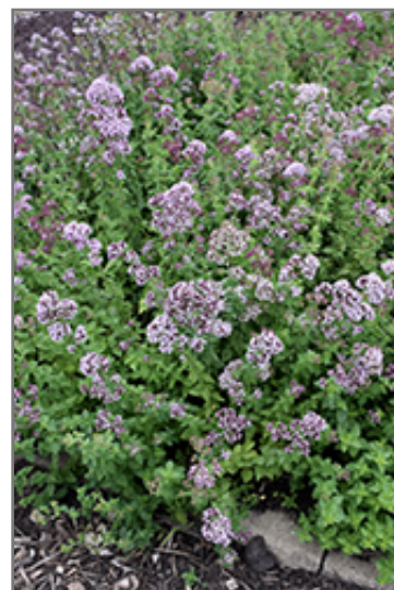
Oregano flowers