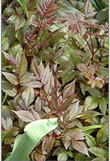
Red Sentinel Astilbe foliage

600 W. Spruce Mitchell, SD 57301 phone: 1-605-996-8444