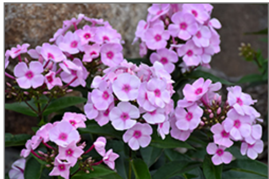
Cotton Candy Garden Phlox flowers